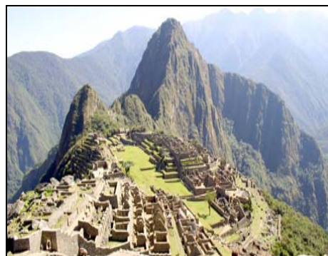
Machu Picchu, Sacred Valley, Peru, 2004.