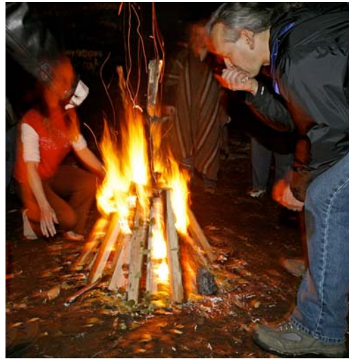
Fire Ceremony, 2007

The Shamanic Practitioner utilizes a healing ceremony and selects the most appropriate energy medicine techniques. The Shamans of the Institute have acquired many sacred healing rituals to facilitate the elimination of dis-ease and restore harmony and happiness. A typical session includes an interview/assessment of the concern/issue. The practitioner determines the location of the source of dissonance and then disengages the energy form. A healing ritual is performed to alleviate the discomfort, pain or symptom(s). Session(s) conclude with further directions and a blessing to complete the healing.